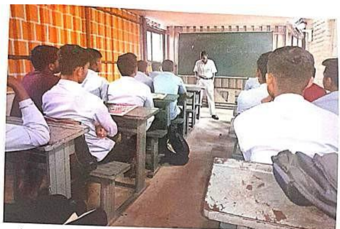
Lecture on guidance For competitive examination