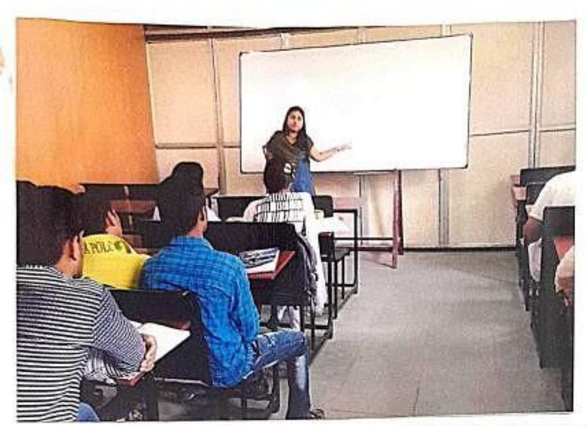
Lecture on guidance for competitive examinations